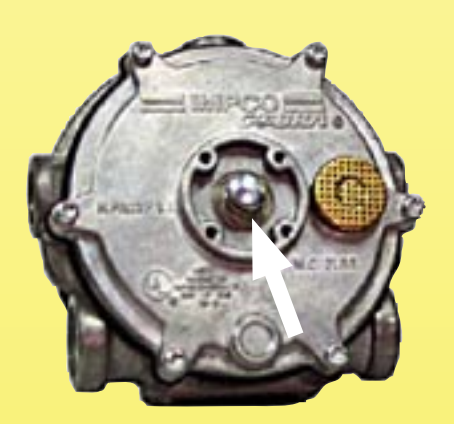
Impco "Cobra" primer button

With the engine running, depress the primer button on the Model J or K vaporizer-regulator. The engine RPM should drop and the engine almost stall or quit running. If you then release the plunger, the engine should return to a smooth idle. If this occurs, the vaporizer is functioning normally and service is not needed. If depressing the plunger causes the engine RPM to smooth out or increase, the mixer air-fuel mixture is too lean and should be adjusted.