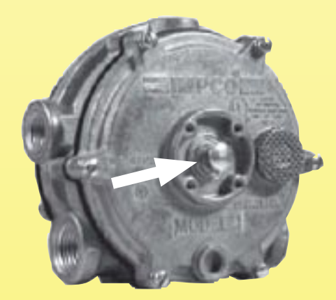
Impco Model "J" primer button

If questionable, run a pressure test. Primary pressure should be 1.5 to 3.5 psig. Secondary pressure should read -1.5 to -5.0" \rm H_2O (a vacuum) with the engine running.