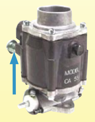
Impco CA-55 idle mixture screw location