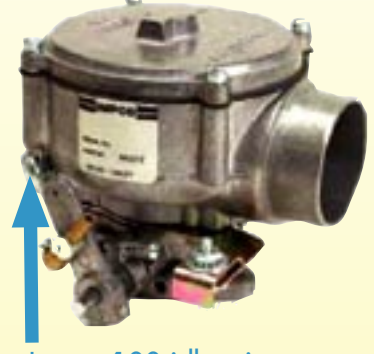
Impco 100 idle mixture screw location

The idle mixture screw is located on the mixer. Rotate the screw counterclockwise for a lean mixture. Turn the screw out as far as possible to see if it reduces emissions to an acceptable reading. If turning the screw out does not decrease CO levels, go to Step 4 before servicing or replacing the mixer.