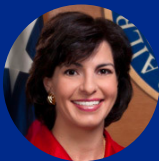
Commissioner Christi Craddick