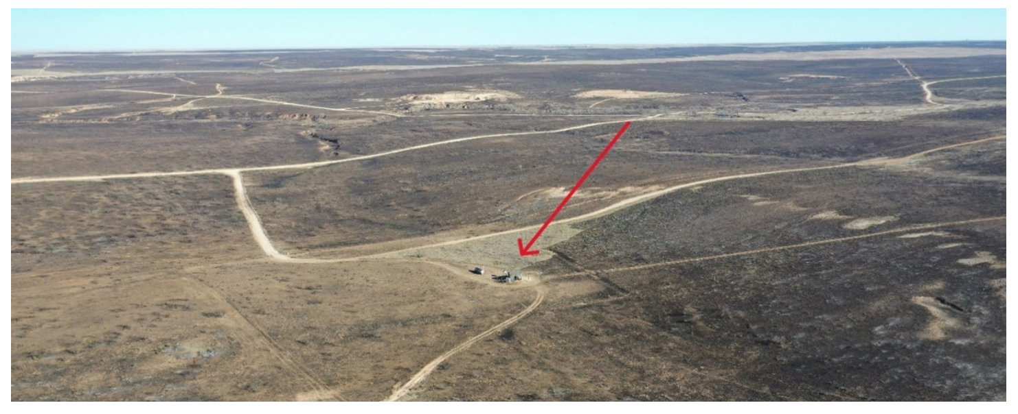
Gas Well in Carson County, Texas Panhandle

Operators in the Panhandle took precautions that proved crucial in safeguarding oil and gas leases from the threat of fire. Steps taken included mowing grass and treating weeds in their area to keep fuels for fires off leases and well pads. The aerial photo shown below is a perfect example of how rigorous safety measures helped save a gas lease in Carson County. You can see where land near the well site burned, as shown by the blackened area, but the fire did not affect the well pointed out in the center.