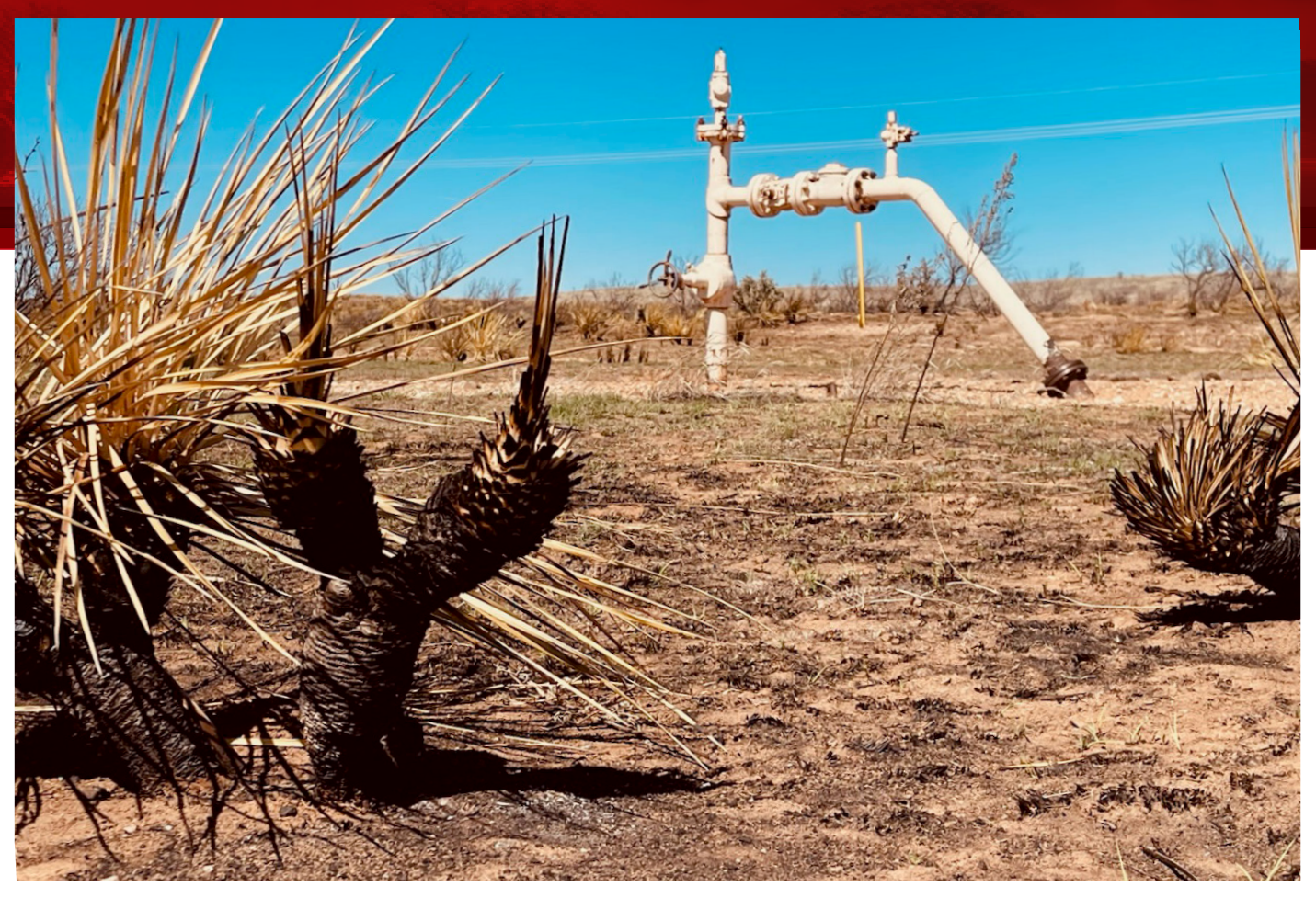
Cleared well site in Moore County

RRC safety officers also joined the state's coordinated response to the wildfires, manning the State Operations Center to be in direct contact with other emergency responders while maintaining communications with regulated entities in the Panhandle including gas utilities.